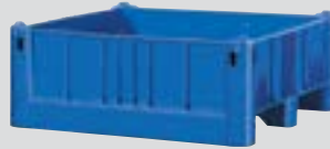
Special height SH - 440