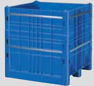
Special height SH - 1140